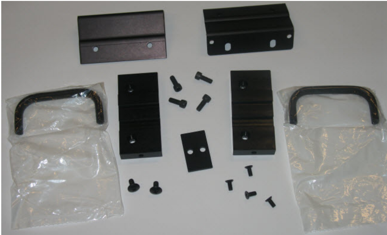
Figure 3: Model 2290-5 rack mount kit hardware

The next figure shows the hardware that you will receive with your rack mount kit. You can use this figure, the Parts list (on page 1), and the previous figures to ensure that you have all of the necessary hardware to mount your instruments.