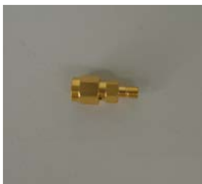
Figure 1: 131936100 SMA M to SMB M adapter connector saver

The Keithley Instruments 131936100 SMA (M) to SMB (M) Adapter Connector Saver is made of gold-plated, machined brass. The adapter is used for quick SMA connections and disconnections when used in conjunction with the 131936200 SMA (F) to SMB (F) Adapter Connector Saver.