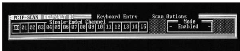
PCIP-Scan Pop-Up Control Panel