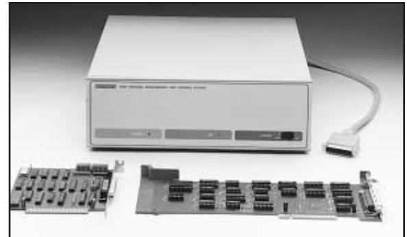
Series 500 Model 500A: 10 Slot Data Acquisition Instrument

The Model 576, shown below, has the functionality of the 575, with the added capability of operating as a standalone instrument and having a standard GPIB interface. The Model 576 can collect and store data, and even control a process without computer intervention, providing high-speed data logging capability.