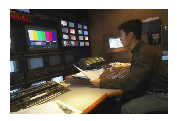
Optimal video quality within your reach