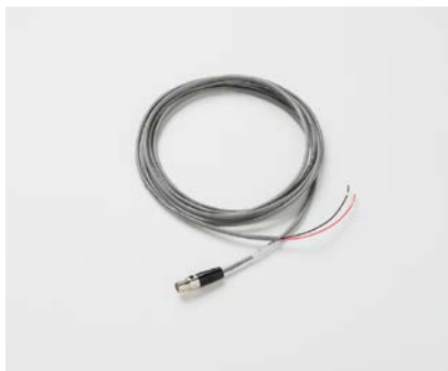
Figure 1: Model 8020-ILC-UNT interlock to unterminated cable

The Keithley Instruments Model 8020-ILC-UNT Unterminated Interlock Cable is used for connecting to the INTERLOCK OUT connector on the Model 8020 for use as a system interlock. The unterminated end of the cable connects to a normally-open switch at device under test (DUT) access point. For information where to connect this cable, refer to the Model 8020 High Power Interface Panel User's Manual.