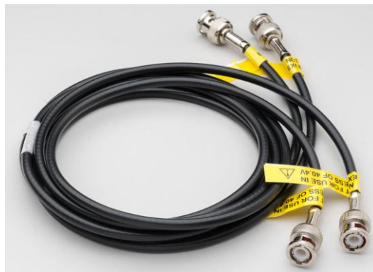
Figure 1: Model 2601B-PULSE-CA2 Coaxial Cables

These cables are intended for use with the Model 2601B-PULSE System SourceMeter® instrument with the 2601B-P-INT Interlock and Cable Connector Box installed.