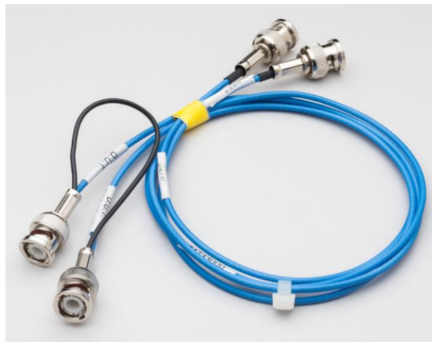
Figure 1: Model 2601B-PULSE-CA3 Cable Kit

This cable kit is intended for use with the Model 2601B-PULSE System SourceMeter® instrument with the 2601B-P-INT Interlock and Cable Connector Box installed.