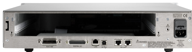
708B rear panel

Prefer to create your own customized application software? Native National Instruments Labview®, IVI-C, and IVI-COM drivers are available for downloading to simplify the programming process. For the Labview® driver please visit www.ni.com ; for IVI drivers please visit www.tek.com .