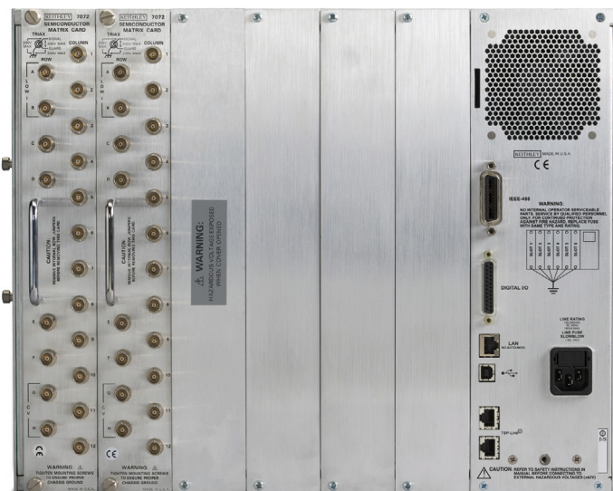
707B rear panel

The 707B and 708B are ideal companion products for systems that incorporate Series 2600B instrumentation, such as Keithley's ACS and S530 integrated test systems. These mainframes share the same TSP, Lua scripting language, and TSP-Link interface as the Series 2600B and support an ultra low current switch matrix (the 7174A) that complements the 2636B's low current sensitivity. The 707B/708B offer test system builders a switch matrix that is fast, scriptable, and works seamlessly with all Series 2600B models.