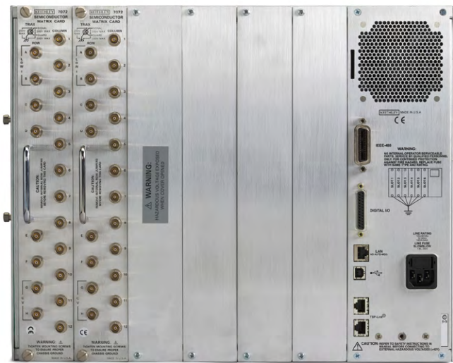
707B rear panel

Prefer to create your own customized application software? Native National Instruments Labview®, IVI-C, and IVI-COM drivers are available for downloading to simplify the programming process. For the Labview® driver please visit www.ni.com ; for IVI drivers please visit www.tek.com .