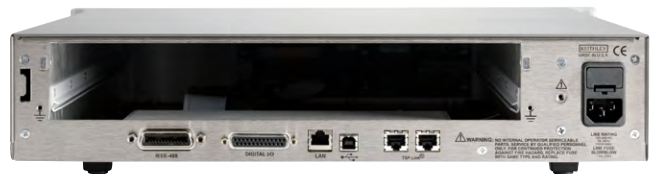
708B rear panel