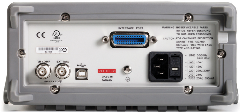
2110 rear panel.