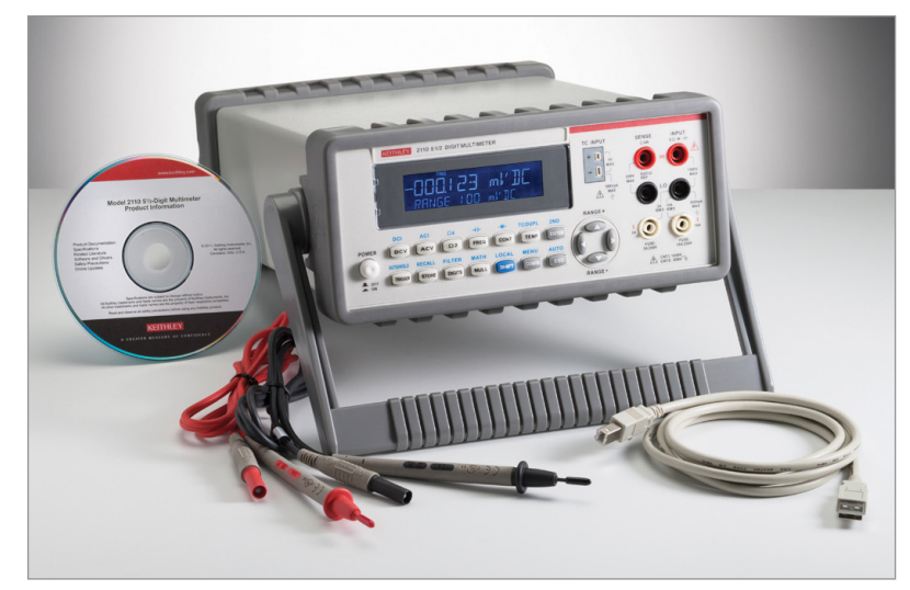
All accessories, such as start-up software, USB cable, power cable, and safety test leads, are included with the 2110.

LabView, IVI-C, and IVI-COM drivers are also supplied to allow for increased flexibility in integrating the 2110 into new and existing systems and test routines.