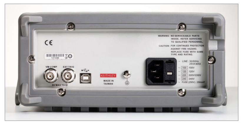
2110 rear panel.