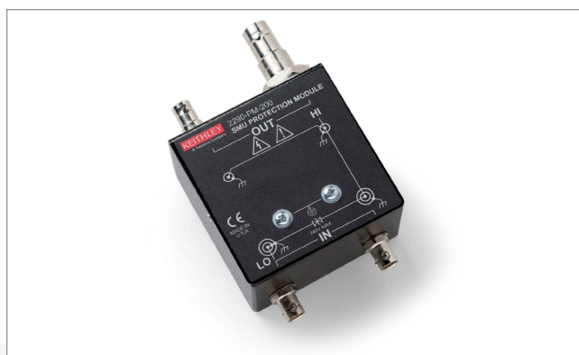
The 2290-PM-200 Protection Module protects low voltage measurement equipment from voltages greater than 200V.

Series 2290 Power Supplies and a 2290-PM-200 SMU Protection Module protect both user and instrumentation from hazardous voltages. An interlock circuit built into the power supplies can be used to ensure that the output voltage is disabled if a high voltage test fixture access