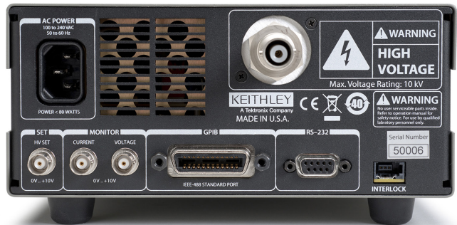
2290-10 rear panel showing the IEEE-488 interface connector, RS-232 interface connector, high voltage output connector, analog control/output connectors, and interlock connector.