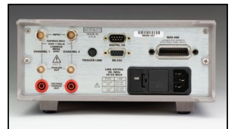
Model 2502 rear panel

The Model 2502 offers low current measurement ranges from 2nA to 20mA in decade steps. This provides for all photodetector current measurement ranges for testing laser diodes and LEDs in applications such as LIV testing, LED total radiance measurements, measurements of cross-talk and insertion loss on optical switches,