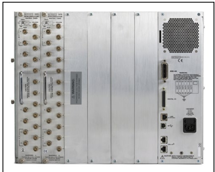
Model 707B rear panel