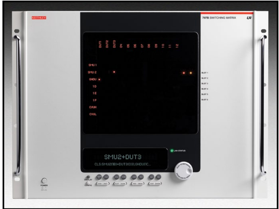
Model 707B Six-slot Semiconductor Switch Matrix Mainframe

The six-slot Model 707B and single-slot Model 708B Semiconductor Switch Matrix Mainframes extend Keithley's decades-long commitment to innovation in switch systems optimized for semiconductor test applications. These mainframes build upon the strengths of their popular predecessors, the Models 707/707A and 708/708A, adding new features and capabilities designed to speed and simplify system integration and test development. New control options and interfaces offer system builders even greater flexibility when configuring high performance switching systems for use in both lab and production environments. Just as important, both new mainframes are compatible with the popular switch cards developed for the Models 707A and 708A, simplifying and minimizing the cost of switch system migration.