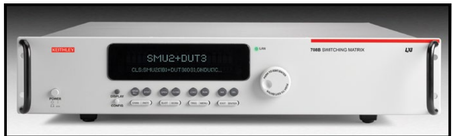
Model 708B Single-slot Semiconductor Switch Matrix Mainframe

High performance Model 707B and 708B semiconductor switch matrix mainframes slash the time from command to connection, offering significantly faster test sequences and overall system throughput than Keithley's earlier 707A and 708A mainframes.