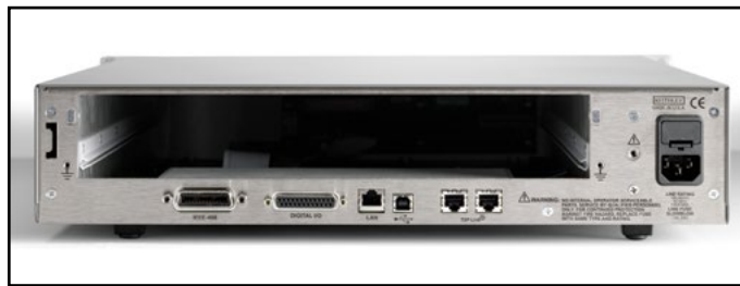
Model 708B rear panel

1. Includes scan.scancount = 100, scan.stepcount ≥3, channel.connectrule = channel.OFF or 0, and relay settle time.