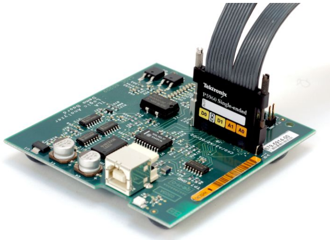
P5960 34-channel D-Max probe

The 17-channel P5910 provides flexible general-purpose probing, with support for 0.100 in. and 2 mm pin spacing, low input capacitance, and accessories for connecting to many industry-standard connections.