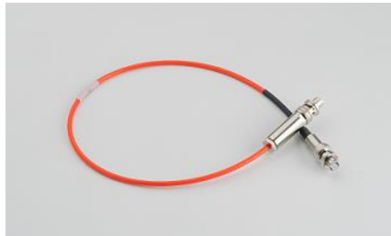
Figure 1: Model SHV-CA-553

You can order the cable in three different lengths (see table below).