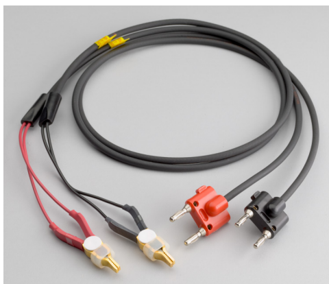
Figure 1: Model 5806 Kelvin Clip Lead Set

The lead set includes two clip test leads, one red and one black, with dual-banana plug terminations. It also includes eight elastic bands.