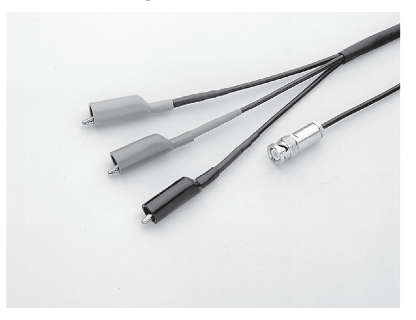
Figure 1: Model 237-ALG-2

The Keithley Instruments Model 237-ALG-2 is a 2 m (6.6 ft) triaxial cable that is terminated with a three-slot male triaxial connector on one end and alligator clips on the other end.