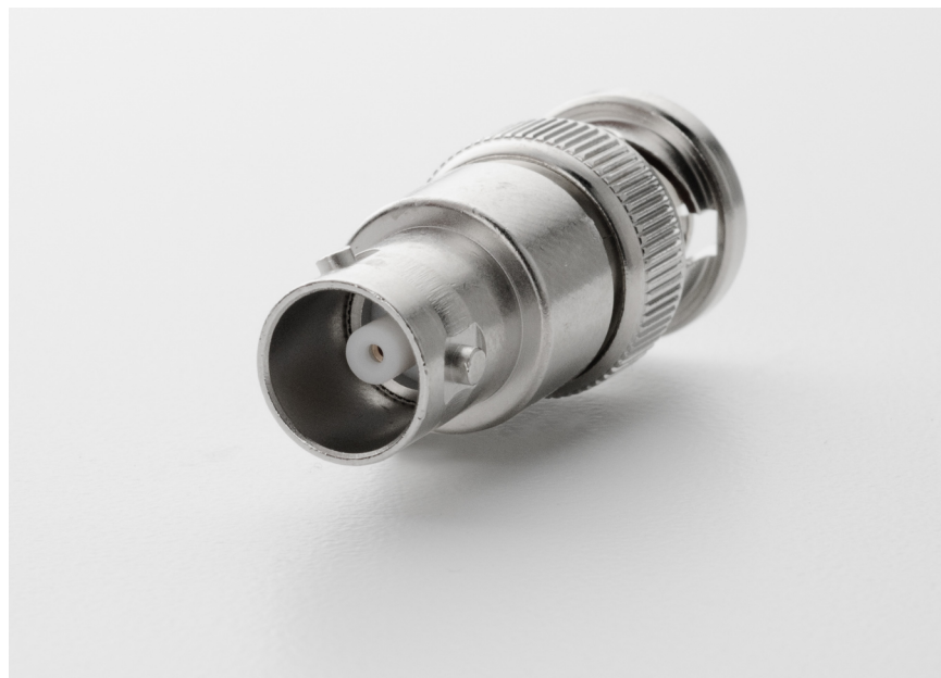
Figure 1: Model 237-BNC-TRX

The BNC end of the Model 237-BNC-TRX High-Voltage 2-Slot BNC to 3-Lug Female Triaxial Adapter will mate directly to an instrument that uses BNC connectors. The other end of the adapter will accommodate a 3-slot triaxial cable to allow connection to equipment that uses 3-lug triaxial connectors.