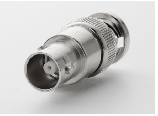
Figure 1: Model 237-BNC-TRX

The BNC end of the Model 237-BNC-TRX High-Voltage 2-Slot BNC to 3-Lug Female Triaxial Adapter mates directly to an instrument that uses BNC connectors. The other end of the adapter accommodates a 3-slot triaxial cable to allow connection to equipment that uses 3-lug triaxial connectors.