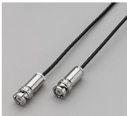
Figure 1: Model 4200-TRX-X cable

The item shipped may vary from the item in the picture