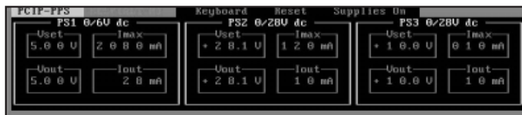
PCIP-PPS Pop Up Control Panel

Call toll free for technical assistance, product support or ordering information, or visit our website at www.keithley.com .