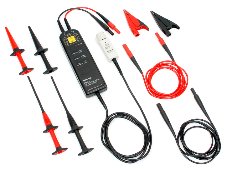
The P52xxA Series probes provide high-voltage differential measurement solutions for any oscilloscope.