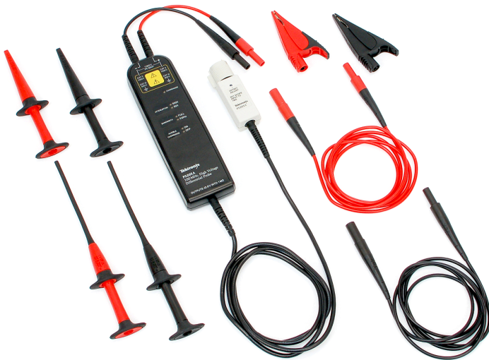
The P52xxA Series probes provide high-voltage differential measurement solutions for any oscilloscope.

Probes and accessories are not covered by the oscilloscope warranty and Service Offerings. Refer to the datasheet of each probe and accessory model for its unique warranty and calibration terms.