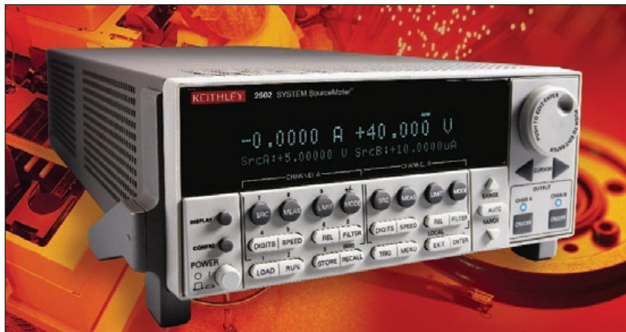
Figure 1. Keithley Model 260X System SourceMeter® Instrument

Simple 2- to 4-pin devices. This DUT category includes diodes, LEDs, transistors,