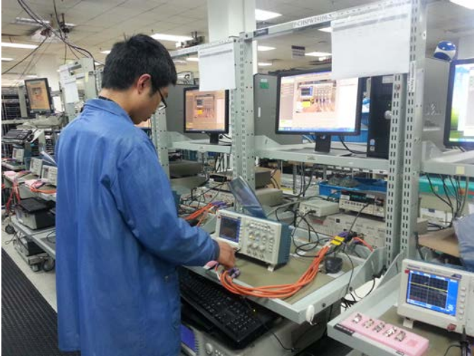
Every Tektronix oscilloscope coming off the production line passes thorough testing and quality inspections.