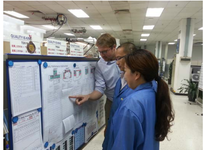
Tektronix quality improvement teams continuously monitor progress towards lower field failure rates