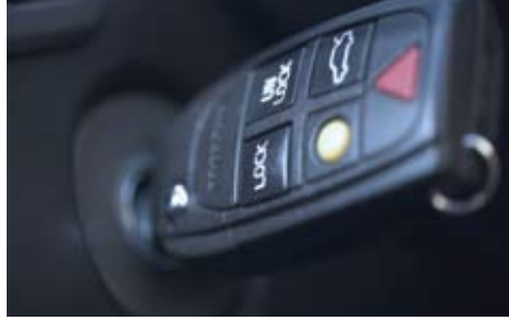
Embedded Systems Technology