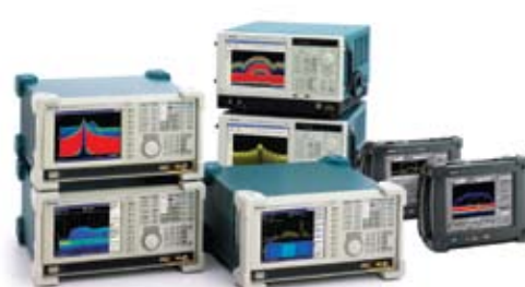
Real-Time Spectrum Analyzers

Engineers repeatedly face difficult challenges to accurately debug, characterize and test electrical designs. Tektronix provides the broadest and most complete portfolio of oscilloscopes and accessories to meet virtually every need, ranging from the entry-level 40-MHz TDS1000B to the world's fastest real-time oscilloscope, the 20-GHz DSA70000 Digital Serial Analyzer. With such a range of features and capabilities, you are sure to get the right product to meet your design and test requirements.