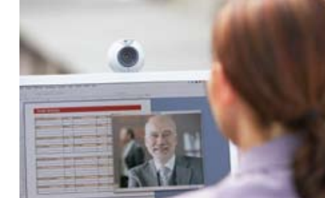
High-Speed Serial Technology