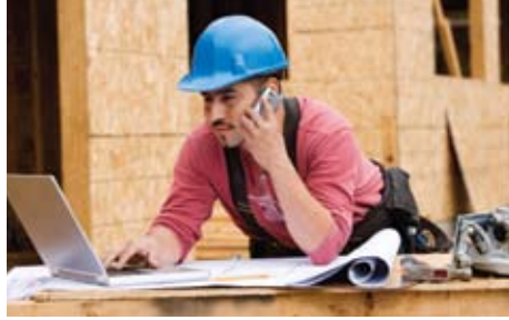
Digital RF Technology