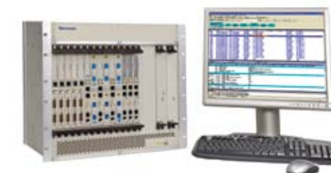
Network Monitoring and Diagnostics

Tektronix is the video test expert, providing the broadest and most comprehensive video test and monitoring portfolio for existing analog and new digital video technologies at most every point in the video ecosystem. Using our solutions, you can effectively integrate new technologies, improve workflow efficiency and achieve business excellence. The portfolio includes MPEG and Baseband Signal Analyzers, Generators, Monitors, and Video and Audio Signal Analyzers—including a unique Picture Quality Analyzer and the world's leading content quality system.