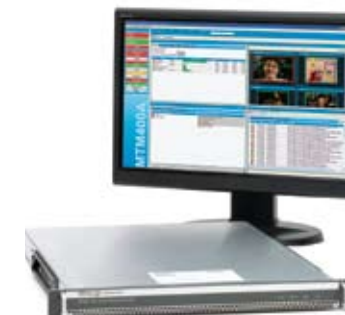
Video Test Instruments and Systems

Easily generate real-world signals: analog, digital or mixed signals, and ideal or distorted signals. Our portfolio of AFG3000, AWG5000, and AWG7000 Series function and arbitrary waveform generators covers a broad range of applications including RF and the fastest high speed serial data technologies. Tektronix generators provide superior performance and feature sets for unrivaled usability, functionality and versatility to shorten development and test cycles.