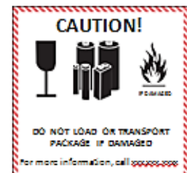
Lithium Battery Label Figure 4

Shipper must complete phone number portion of label.