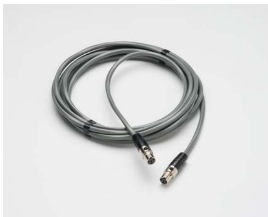
Figure 1: Model 8020-ILC-1 interlock cable

This cable is used to daisy chain (wire together in sequence) one of the Model 8020 interlocks to another Model 8020. Once daisy-chained, the system interlock and one of the Model 8020 cover interlocks will enable or disable the interlock feature of all connected instruments. For more information about interlocks, refer to the Model 8020 High Power Interface Panel User's Manual.