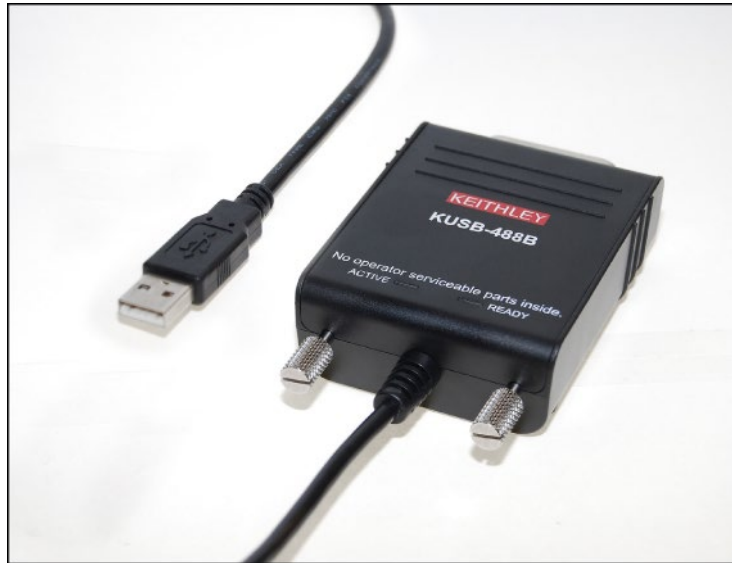
Figure 1: PCT-DOC-KIT supplied accessories

The following table lists the parts that are supplied with each Parametric Curve Tracer (PCT) configuration.