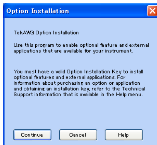
Figure 1: Option Installation dialog box (1)