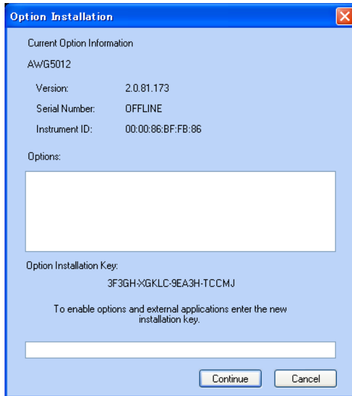
Figure 2: Option Installation dialog box (2)