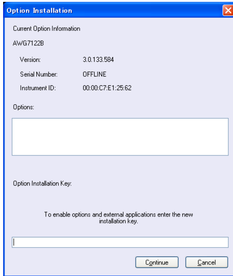
Figure 2: Option Installation dialog box (2)