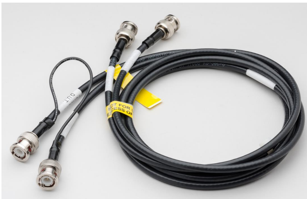
Figure 1: 2601B-PULSE-CA1 Cable Kit FORCE cables

This cable kit is intended for use with the Model 2601B-PULSE System SourceMeter® instrument with the 2601B-P-INT Interlock and Cable Connector Box installed.