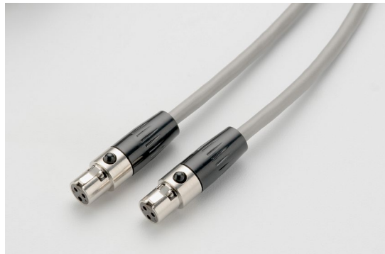
Figure 1: Model 236-ILC-3

The item shipped may vary from the item in the picture.