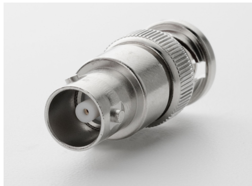
Figure 1: Model 237-BNC-TRX

The BNC end of the Model 237-BNC-TRX High-Voltage 2-Slot BNC to 3-Lug Female Triaxial Adapter mates directly to an instrument that uses BNC connectors. The other end of the adapter accommodates a 3-slot triaxial cable to allow connection to equipment that uses 3-lug triaxial connectors.